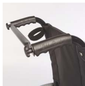
Version with back angle adjustment