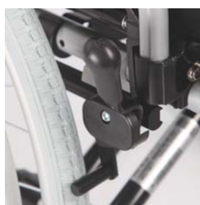
Knee lever wheel lock