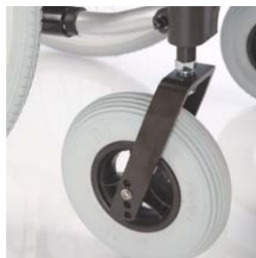
Steering caster 8" x 50 mm PU