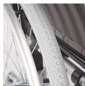
Drive wheel with aluminium push ring