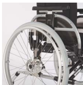
Version with drum wheel lock