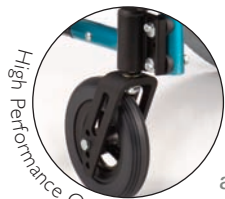
High Performance Options

The Quickie 2 is the most popular ultra-lightweight folding frame wheelchair on the market, ideal for riders with an array of interchangeable frame components that can easily be adjusted as needs evolve. Our True Fit program provides a one-time free replacement (to the original owner within three years) for growth of the seat sling, back upholstery, footplates, hangers, back tubes, frames and cross braces. (Also provided for Quickie 2HP.)