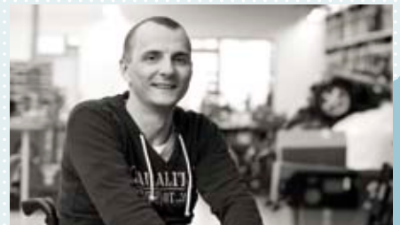
René Page 20

→ Plus Special: German Engineering Page 26