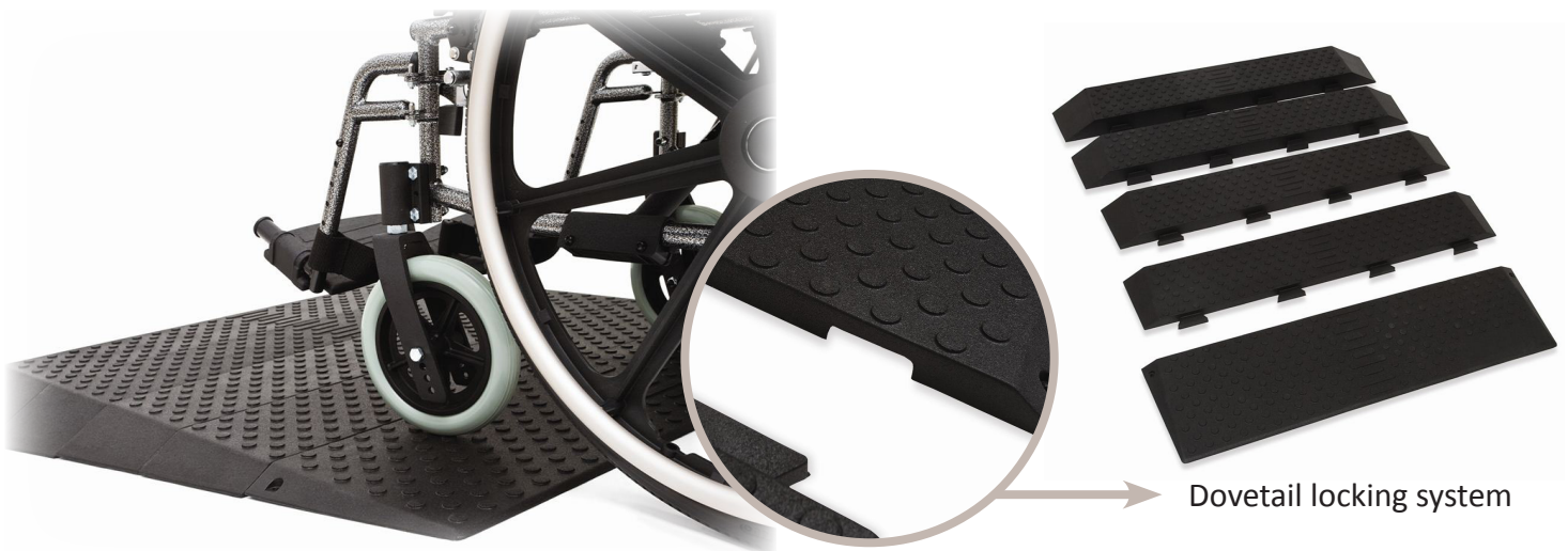
Dovetail locking system